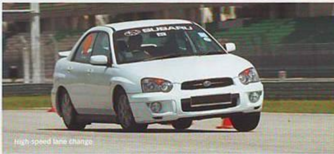
High speed lane change