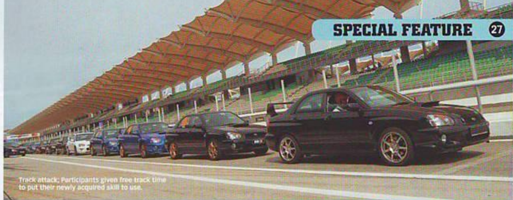
Track attack: Participants given free track time to put their newly acquired skill to use.